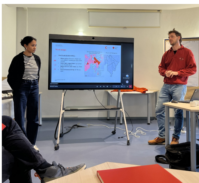
(1) © Colombian Red Cross Regional GIS Training in Colombia (2) © HeiGIT Mapathon at HeiGIT (3) © HeiGIT GIS Training for Healthcare Professionals