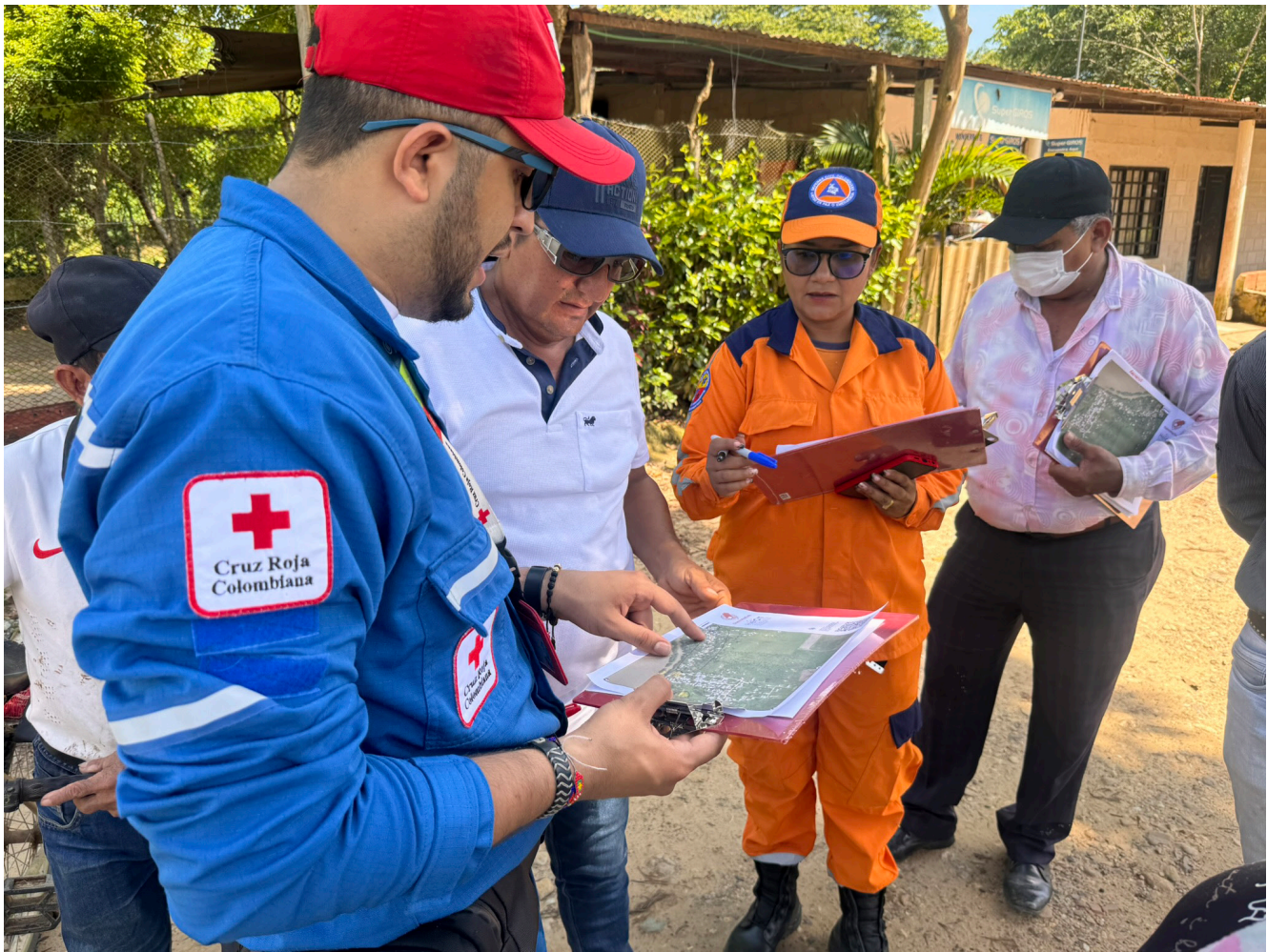
Use of the Sketch Map Tool for disaster preparedness in Colombia

Joint activities include: GIS training from basic to advanced levels with a focus on geospatial analyses for humanitarian projects in anticipatory action, disaster risk reduction, and health.