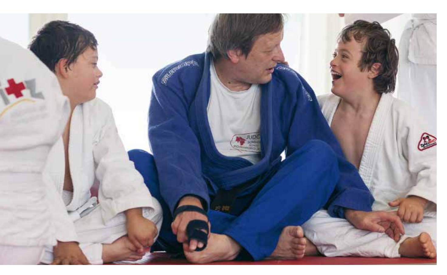
4.2.4 Participation and inclusion for the disabled and disadvantaged